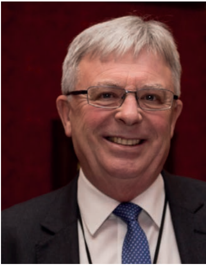
The Rt Hon Lord Bradley